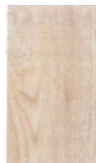
520 TOI TOI