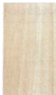
500 ROSE GOLD